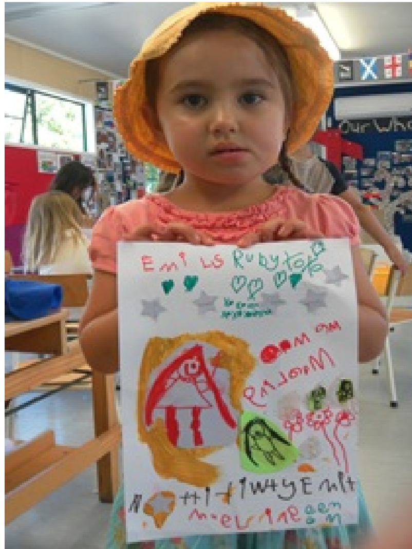
Letters, Words and Sounds