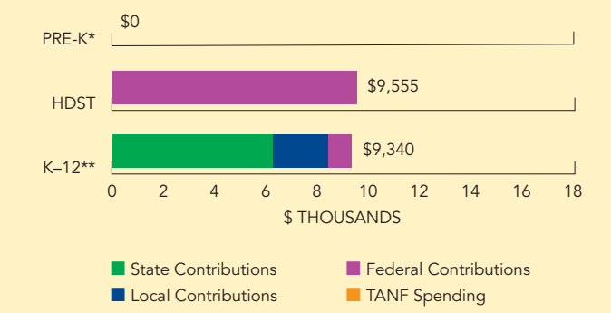
SPENDING PER CHILD ENROLLED

<sup>1</sup> The state was unable to break down the total number of children served by age. This number represents estimated funded slots in Head Start.