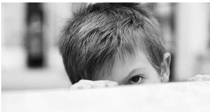
Cortisol levels rise in normally developing children when presented with social stresses such as joining unfamiliar peer groups.

Researchers have known for some time that the level of the hormone cortisol rises in preschoolers when presented with social stresses such as joining unfamiliar peer groups. Cortisol rises in normally developing children in socially challenging situations but it remains puzzlingly low in children who develop antisocial behaviors. This atypical cortisol response is consistent with other patterns of response in delinquent youth, such as difficulty interpreting social cues and being less responsive to social reinforcement. Cortisol is readily measured from saliva samples, making it a useful measure of stress in young children. It also sheds light on how early experiences and early intervention affect neurobiological systems.