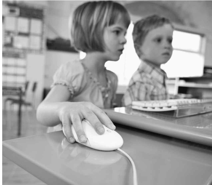
Early childhood experiences have a uniquely powerful influence on the development of cognitive and social skills.