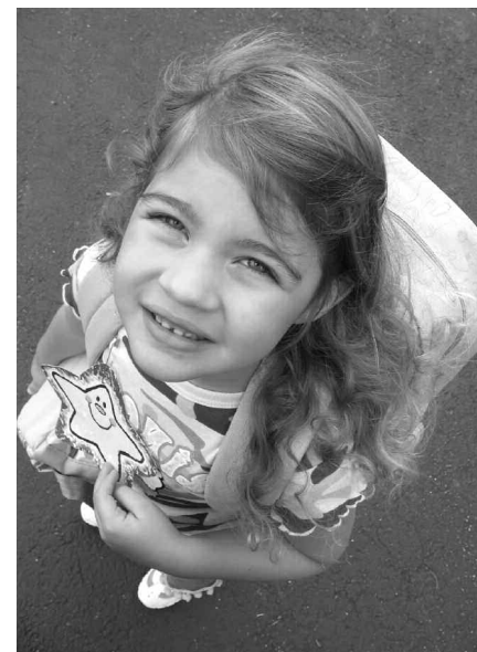
More parents are basing child care and pre-K decisions on star ratings.

North Carolina, one of the early states to establish a star-based system, continues to lead the way. The state recently upgraded its 5-Star